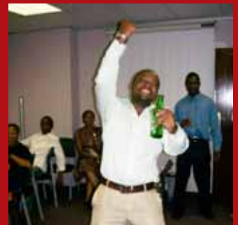
Oh lala...Manzi is quenching that thirst!