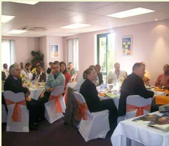
Clients at the Technical Update