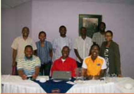
Nkonki and Gobodo candidates